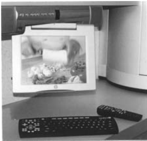
Television, radio, DVD and CD players, internet browser and key board for mounting under wall cabinets – by Kitchenvision

Televisions should be kept away from direct sources of heat and moisture, and the screens out of the path of direct sunlight.