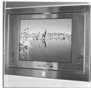
Television with 15" swivelling screen in SS frame to suit 500 and 600 mm wide tall cupboards – by Kitchenvision