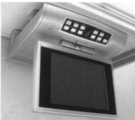
LCD television and radio – by Häfele